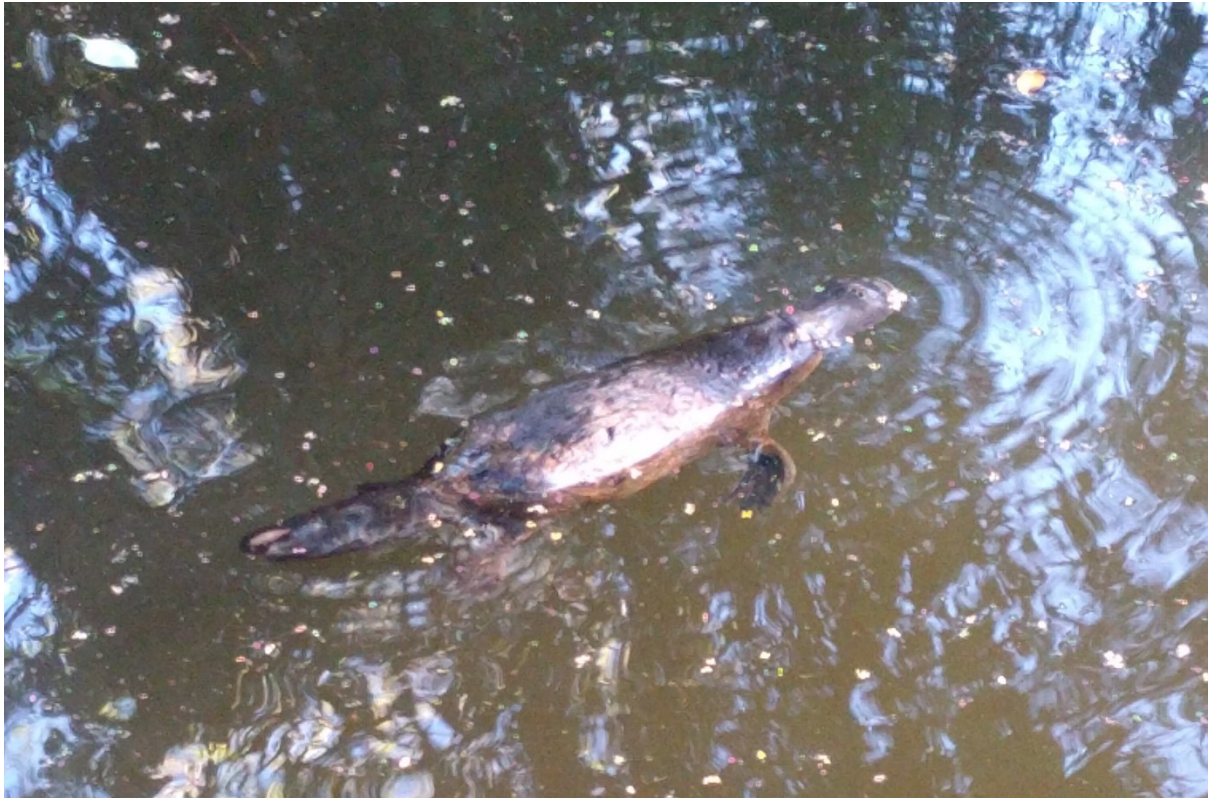
Figure 2. Jasmin Bourne was lucky to have a morning with a platypus at the Adavale Street site.