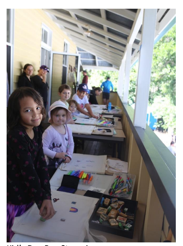
Kid's Day Bag Stamping

We are grateful to Seqwater Water for Life Community Grant as a major sponsor, Brisbane City Council Creek Catchment Program for the hiring of pagodas, and the continuing support