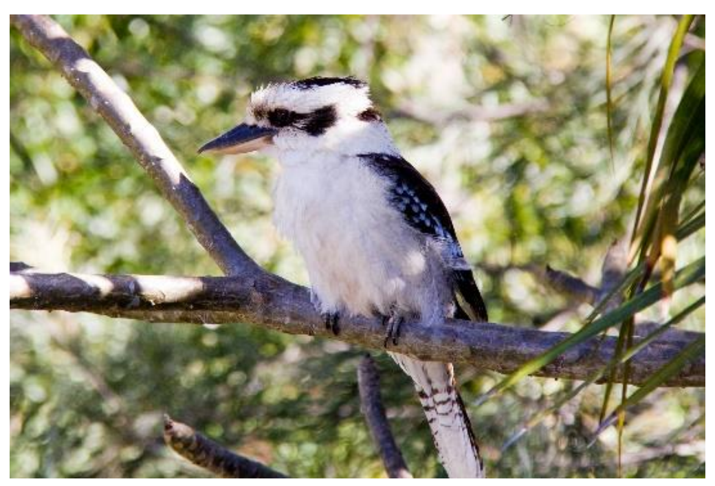
A kookaburra taking a rest from laughing