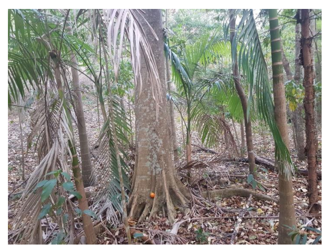
Blue Quandong at Simpson's Ck inlet planted 2004