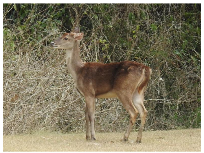
Local (Feral) Wildlife