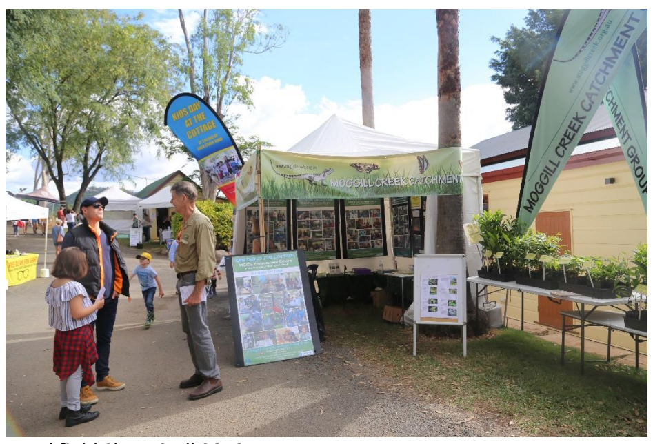
Brookfield Show Stall 2019

MCCG was also on public display at other venues and events: Kenmore Village Shopping Centre (Friday 26 & Saturday 27<sup>th</sup> April) Brookfield Show (Friday 17<sup>th</sup> – Sunday 19<sup>th</sup> May) We were again a finalist in the Queensland Community Achievement Awards. New long Banners and very large Teardrop banners gave us a more noticeable presence at these events.