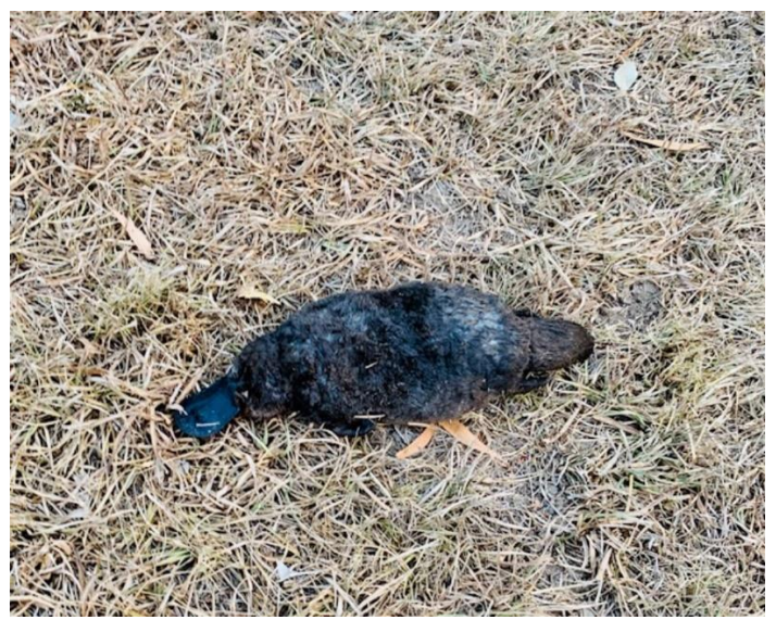
Dead Platypus in Blackbutt Place Park - Impact of drought?