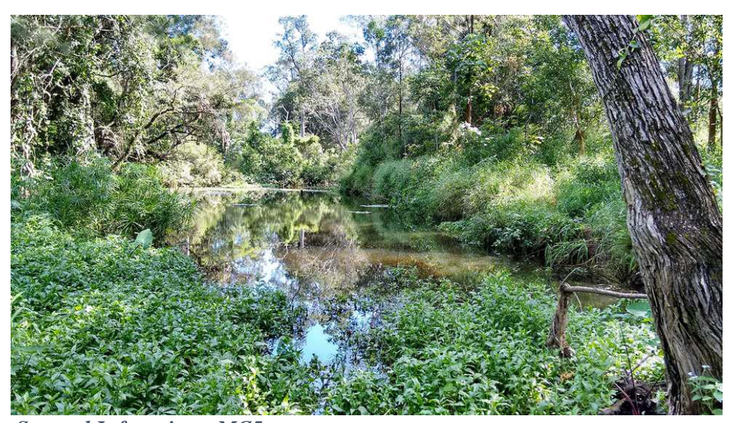
Senegal Infestation - MC5

All the data are in the process of being put into a new database being developed in conjunction with the BCC. Data collection has been by 20-30 wonderful volunteers, many of whom have been trained through workshops provided through the BCC, Healthy Land and Water (HLW) and MCCG. In addition, the BCC has been very supportive of our program through access to Horiba water quality instruments and chemicals for in-field calibration.