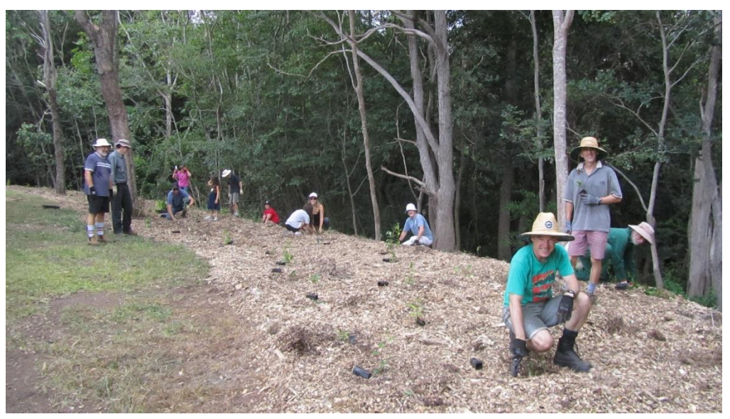
Planting in Tuckett St. Park

This year because of the extraordinary drought conditions we have had to devote a lot of time to watering our plantings and as usual we also spent many hours on weed removal and control. In this respect the almost complete lack of rain over winter and early spring has been helpful in that it allowed us to access areas that previously were almost impenetrable due to the growth of exotic grasses and weed vines. However the drought also had a devastating impact on some of our wildlife (see below). Over the year, our group contributed more than 320 volunteer hours and planted 880 native trees and shrubs.