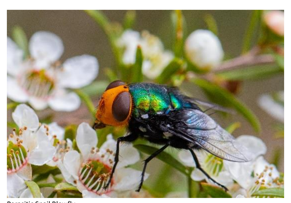
Parasitic Snail Blowfly