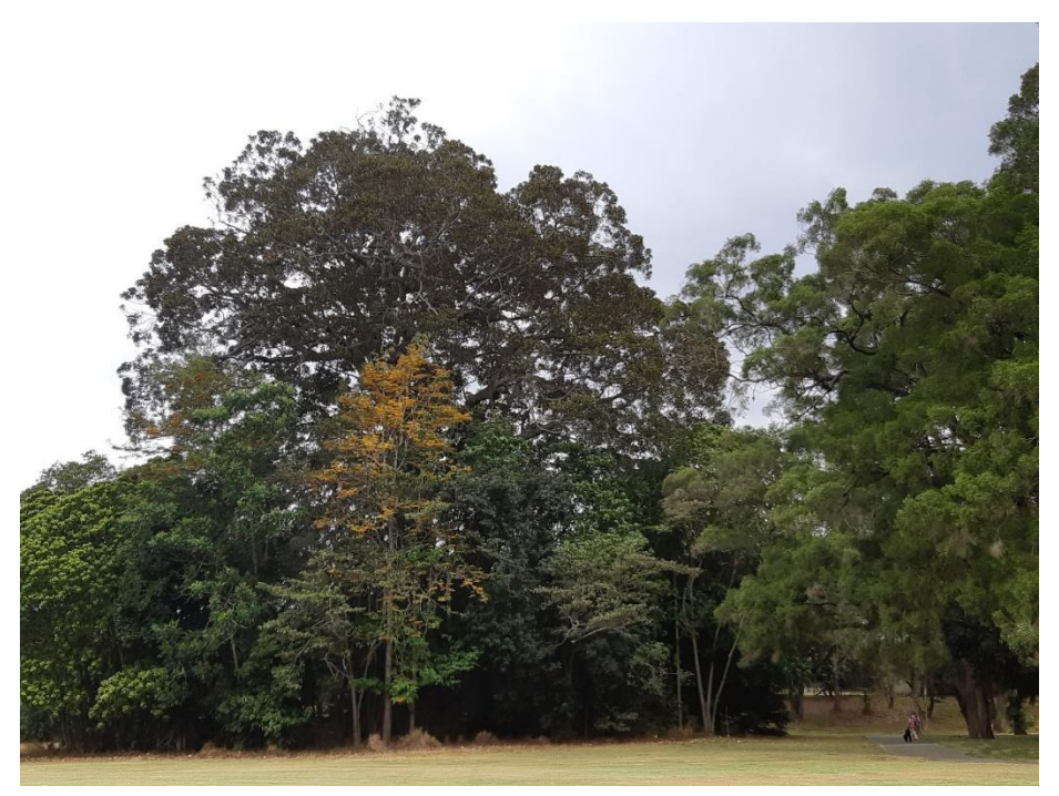
Moreton Bay Fig in Dumbarton Drive Park, Brookfield