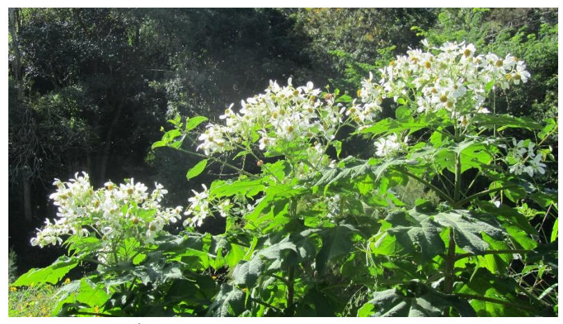
Anzac Tree Daisy

In addition to the contractor activities there were at least 4 occasions when MCCG volunteers carried out brushcutting and spraying of weed regrowth particularly prior to and following replanting activities. Most of the first planting had good quality corflute protectors pegged with hardwood stakes. As some plants grew rapidly, the protectors were then shifted to smaller weaker plants. This was repeated with each planting.