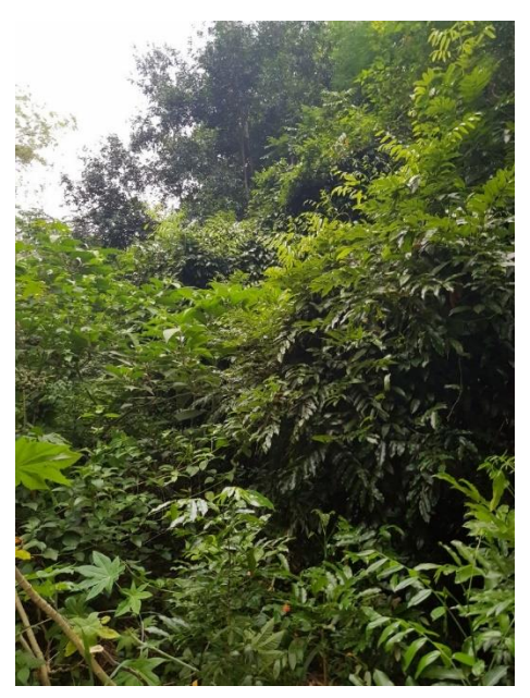
Birdwing Butterfly Vine at Gold Creek Dam planted circa 2008