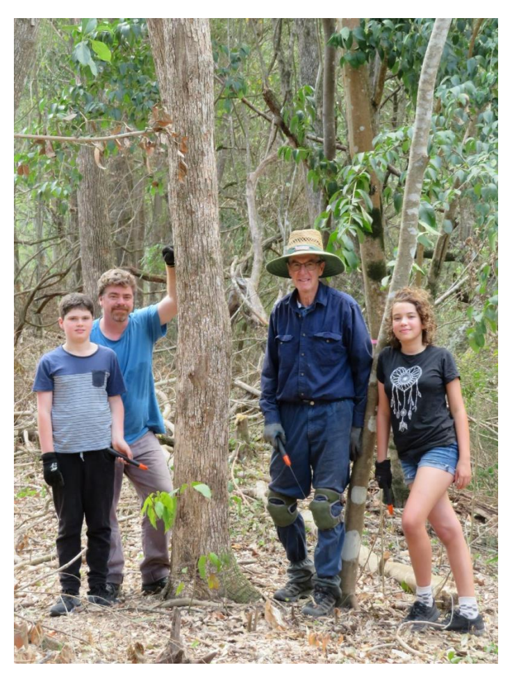
Volunteers at Deerhurst Park site

Most of our effort was directed at clearing very dense stands of Ochna and Chinese Elms along about 130m of creek frontage around 100m in from Brookfield Road on the Deerhurst Road side of the park. Again, we were aided in this by the Brookfield Bike Riders Club. This effort led to a successful CCA application to remove and mulch the remaining large weed trees. Hopefully this will occur in January with planting to occur in March or April 2020.