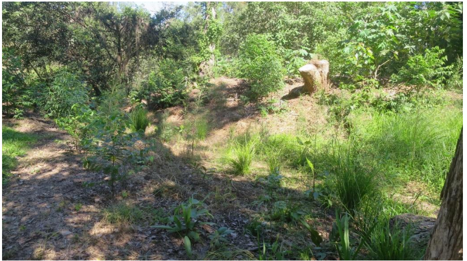
Kenmore State High School: Total Hours 320 Plants 1000

National Tree Day planting (26th July) with years 10/11/12 students established 1000 plants along creek bank between McKay Brook and Moggill creek junction with 80 students