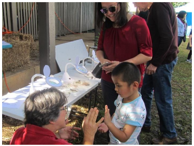
Under the Microscope