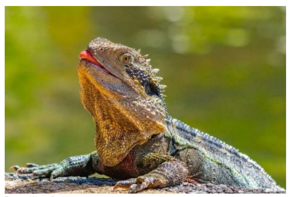
Eastern Water Dragon