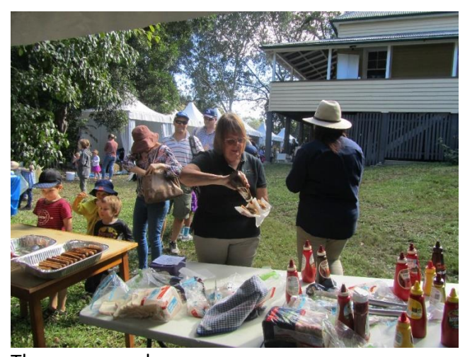
The ever-popular snags