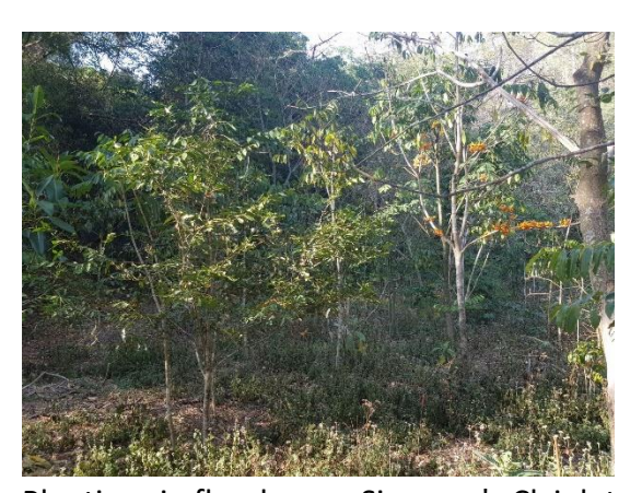
Plantings in flood zone, Simpson's Ck inlet